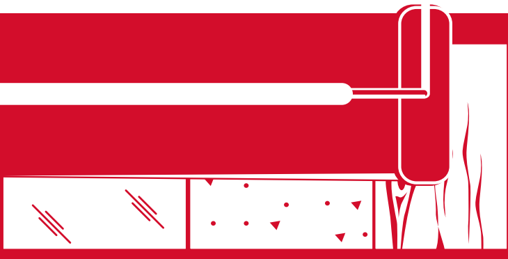
Stainless Steel / Metal