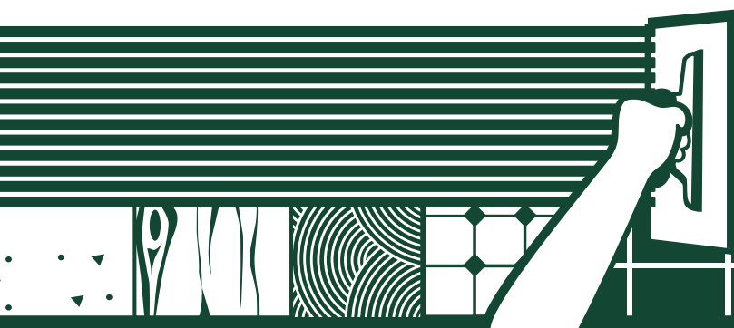
Concrete Exterior-Grade Plywood Cutback Adhesive Residue Existing VAT, VCT and Non-Cushioned Vinyl Sheet Goods Existing Tile